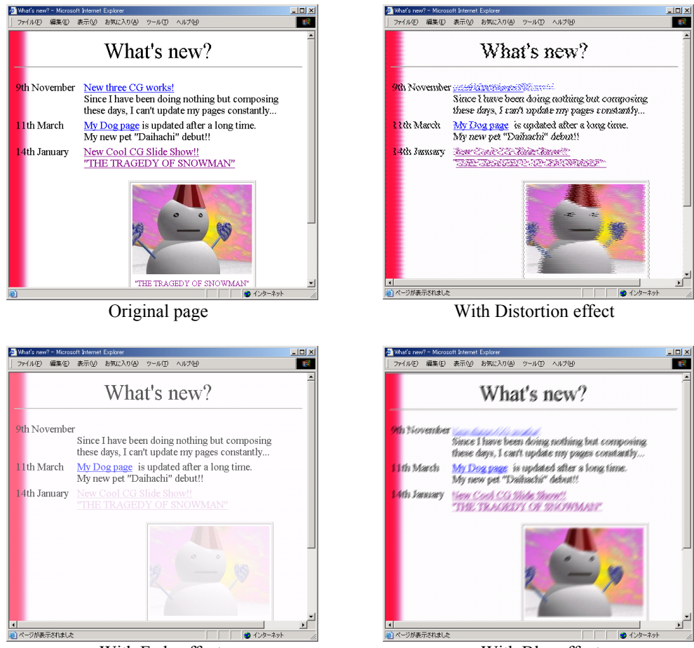
With Fade effect

We developed three variations of Dying Link effects, namely Distortion , Fade , and Blur . Users can cycle these effects by hitting the "reload" button of standard Web browsers. Figure 3 shows the examples of the effects.