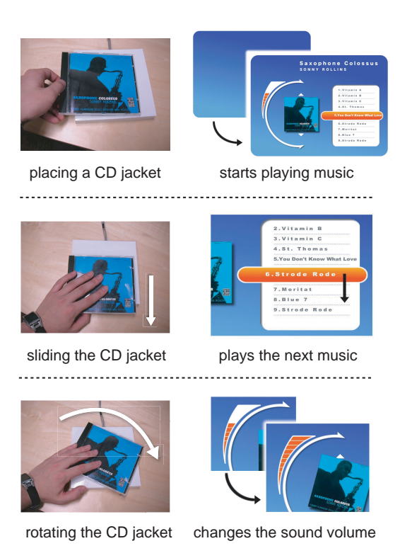
Fig. 3. Controlling the Music Player.

to tell that he wants to convey the information to the new location. In this case, virtual Drag and Drop (or sometimes called "Pick and Drop"[5]) can be performed, just like other systems for using objects for carrying information[6][7]. If a person selects a TV program on a MouseField by using a TV block, he can bring the object to a different place with another MouseField and use the object to see the rest of the program there. In this way, MouseField can enable various interaction techniques which were only available with special and fragile input/output devices.