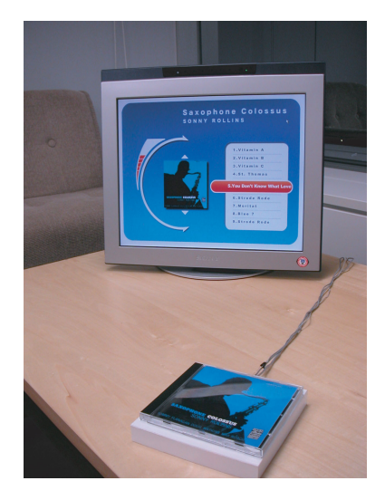
Fig. 2. PlayStand++: A Music Player with MouseField.

Similarly, Table 2 shows the comparison between using a MouseField and using a menu for selecting an item from a list. In this way, we can perform various kinds of GUI operations by putting an object on a MouseField and moving it. Nothing happens if the RFID was not recognized by the reader for some reason, just like nothing happens if people do not press the mouse button in standard GUI widgets.