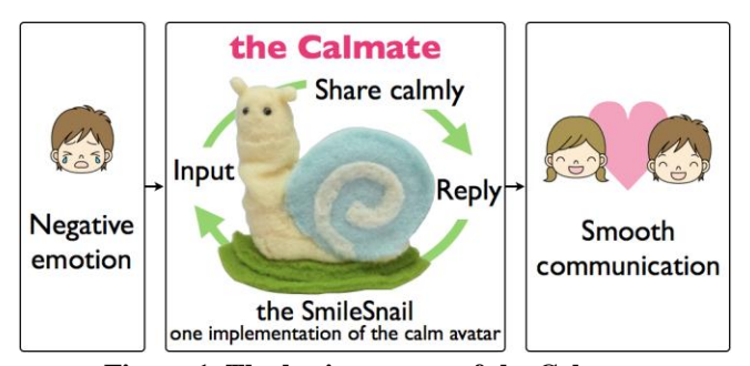
Figure 1. The basic concept of the Calmate A couple member can easily transmit his/her negative feeling and receive feedback from the partner in calm way through a physical avatar.

Copyright is held by the author/owner(s). UbiComp'12 , September 5-8, 2012, Pittsburgh, USA. ACM 978-1-4503-1224-0/12/09.