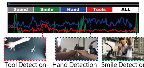
Figure 4. Examples of multiple scene search functions

The scene search function visualizes various features of videos using image analysis techniques to help users review videos effectively. First, we recorded several manufacturing workshops and analyze videos of each perspective. In result, we found several detectable features as follows: (1) facial expressions (e.g., smiles) of attendees in the third-party view, (2) use of hands and a tool in the participant view, (3) overall tools and parts in the overhead view. Therefore, we developed three visualization functions: (1) smile detection (third-party view) using OpenCV, (2) hand detection (participant view) using color recognition, and (3) tool detection (overhead/participant view) using SURF. Figure 4 shows the example of visualization applied for the videos of a quick workshop to create a laser craft. The lengths of the videos are about 10 minutes. The attached images are example scenes searched by this function. Figure 4 shows the example of visualization applied for the videos of a quick workshop to create a laser craft. The lengths of the videos are about 10 minutes. The attached images are example scenes searched by this function.