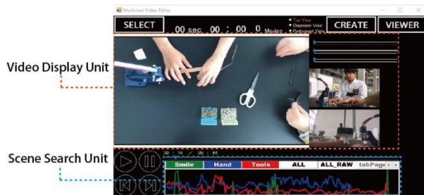
Figure 3. Interface of video-edit system

We performed video recording by using a smartphone prepared by the workshop's organizer. As described above, smartphones were installed in multiple locations such as the overhead/third-party/participant perspectives. To record the video from the overhead perspective, we used our own frame to record from the top of the desk at a distance of about 1 m. To record the video from the third-party perspective, we prepared a small fixture, such as a tripod, for setting the smartphone on the opposite side of the participants. For the participant perspective, we mounted a wearable fixture with a 3D printer to place the smartphone around the neck.